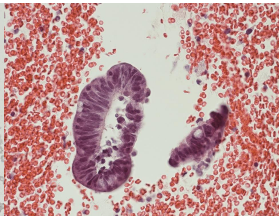
FNA koagel HE